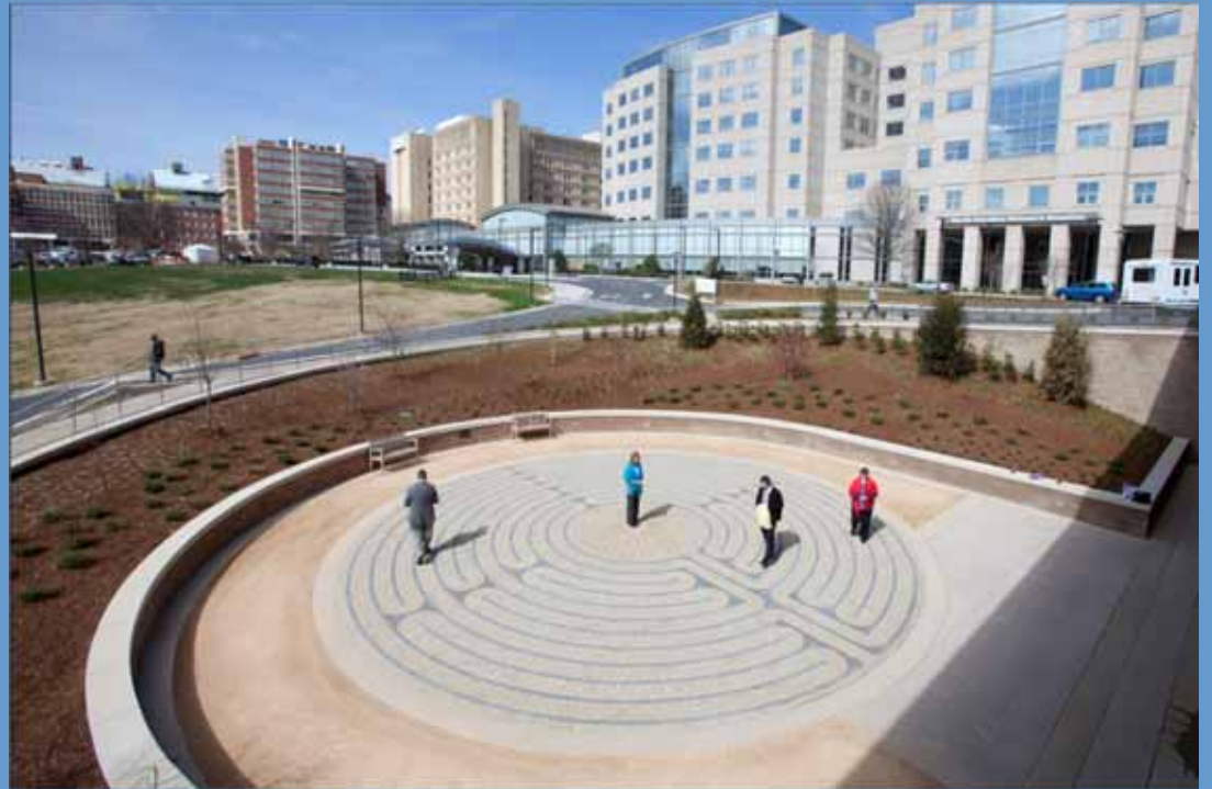
Labyrinth and Garden